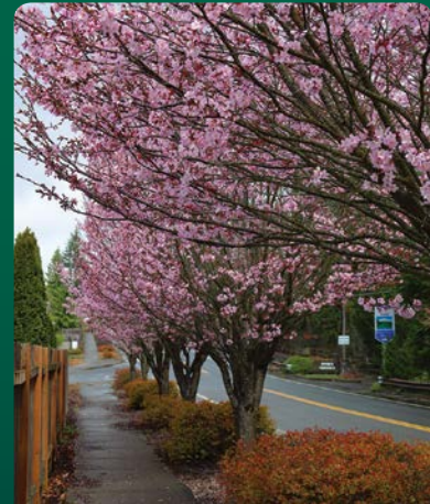
Prunus sargentii 'JFS-KW58'

A small tree of rare beauty, this trifoliate maple's compound leaves give it a delicate texture in summer, then display long lasting red fall color. Exfoliating orange-brown to cinnamon-brown bark creates year round interest.